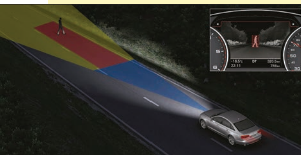
The 2012 Audi A6 includes a night vision assistant with pedestrian headlighting—one of the many types of ADAS that are showing up on today’s vehicles.

The full AGSC AGRSS™ Standards Committee will next meet on Wednesday, October 5, from 7 a.m. to 9 a.m., at Auto Glass Week in San Antonio. The meeting will be held at the San Antonio Marriott Rivercenter.